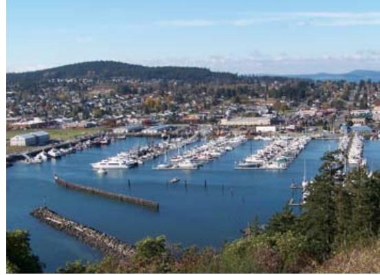
20 - 22 May Cap Sante Boat Haven, Anacortes Anacortes Waterfront Festival