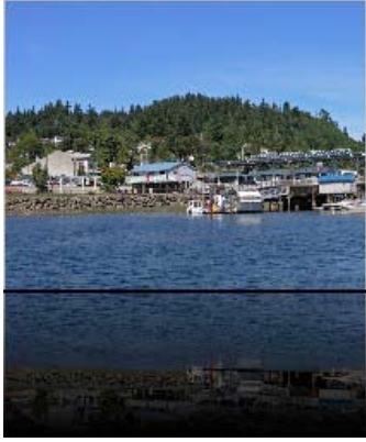
29 April - 1 May Kingston Marina