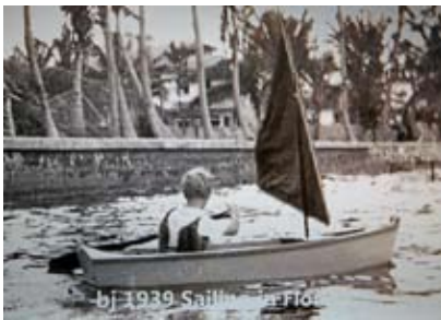
Photo to the left: Taken in 1939 in Florida, where they had moved right before the German Invasion