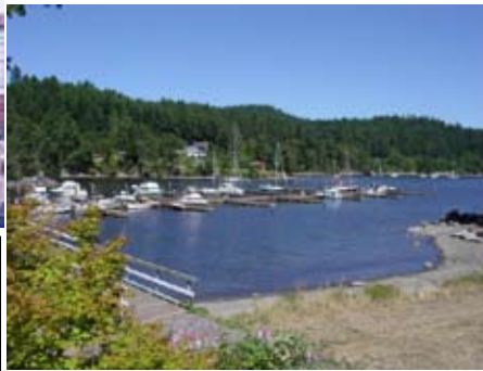
19 - 21 Aug. Port Browning, Canada BSPS Invited to Join VISD