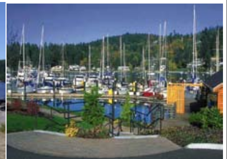
16-18 Sept. Arabella's Landing Gig Harbor