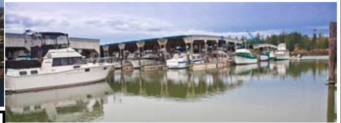
22 - 24 July La Conner Marina