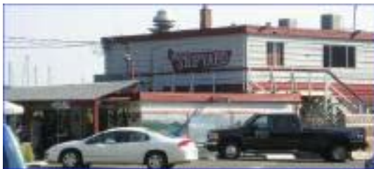
29 July -1 Aug. Maple Bay, Canada Joint Rendezvous with Norvan