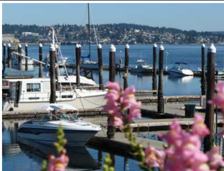
30 Sept. - 2 Oct. Port Orchard Marina for Soup Pot Rendezvous with Bremerton

• • • • • • There are three new venues offered for 2011, • • which will be interesting and fun! Also, note the new • • Canadian venue with VISD. Mark your calendars. • • • • • •