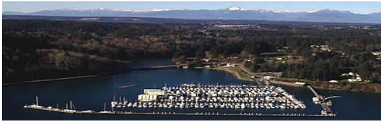
17 - 19 June Brownsville Marina for Annual Salmon Bake