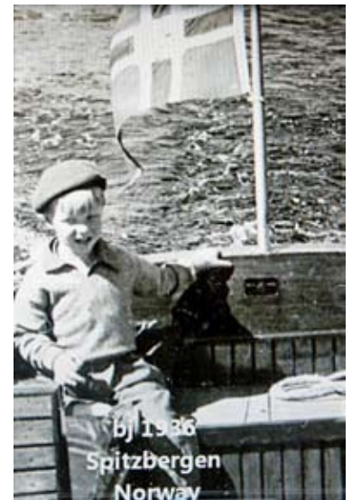
Photo to the right: Taken in 1936 in Spitzbergen, Norway. As you can see he obviously was born to sail.

Photo to the left: Taken in 1939 in Florida, where they had moved right before the German Invasion