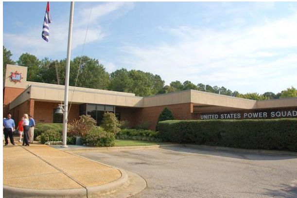
USPS Headquarters building, Raleigh, N.C.