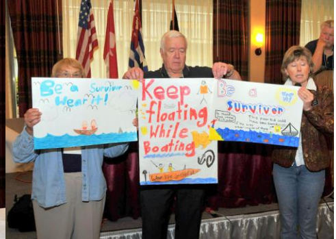
Youth poster winners